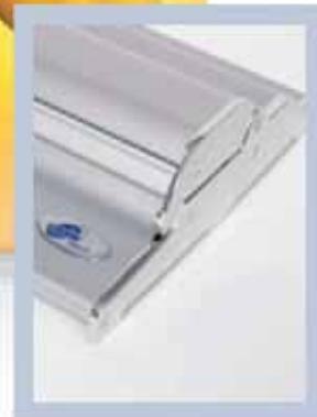
Roll Up Professional has a more exclusive design with countersunk screw heads.