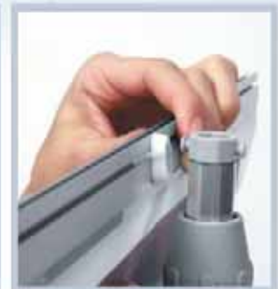
Simple and smart way to secure the image.