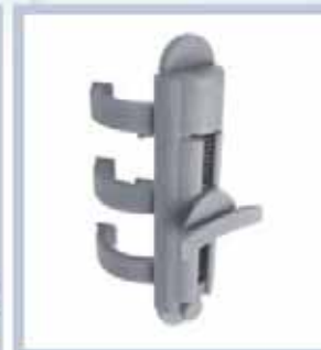
The bottom spring fastener keeps the image stretched. A perfect result everytime!