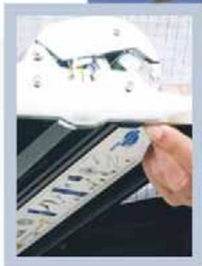
Images on Roll Up Professional can be changed at the simple touch of a button.