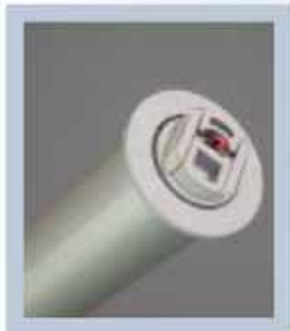
Motor inside Bar lasts for days.

Can Rotate Either Direction - up or down, it's up to you!