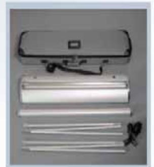
Comes with Carry Case, all set up materials and power supply.