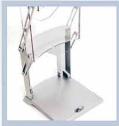
Designed to be both sleek and stable.