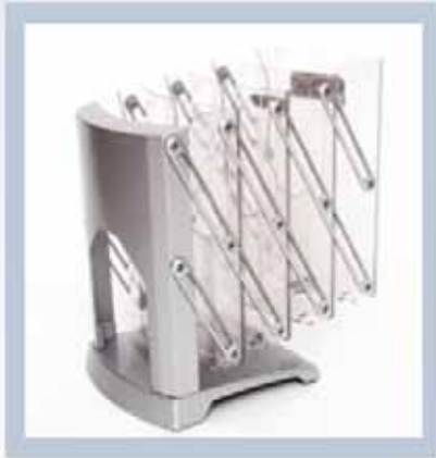
The brochure stand folds and unfolds like an accordion.