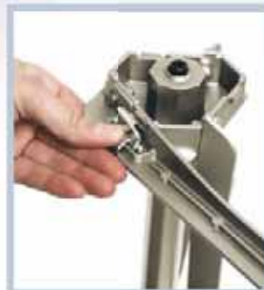
The support legs fold and unfold at the click of a button.